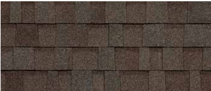
Teak† Not Available in Service Area 1 (see map).