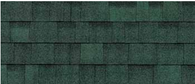
Chateau Green† Not Available in Service Area 1 (see map).